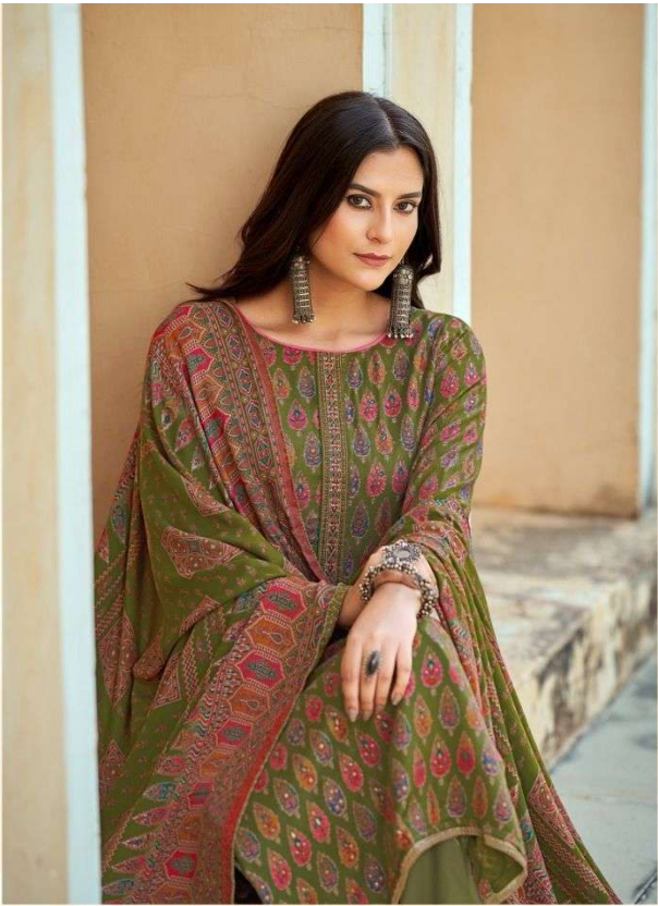
MESMERIZING Rule over the stylish mosses with