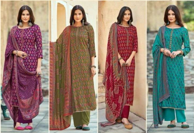
Code # 1005