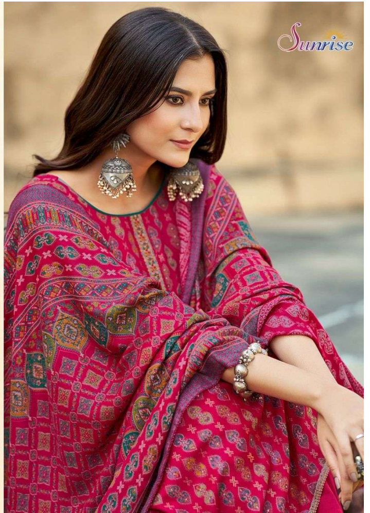
Code # 1008