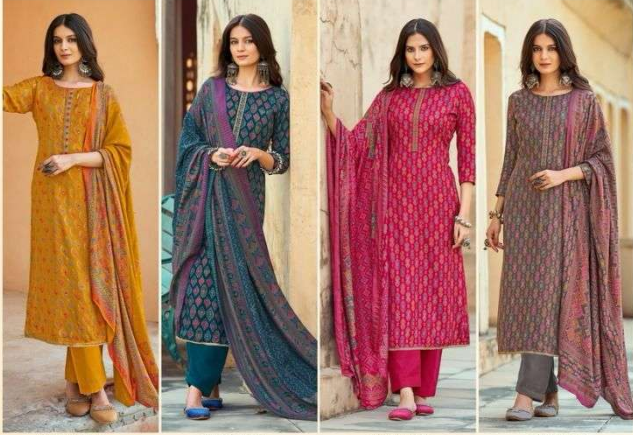
Code # 1001