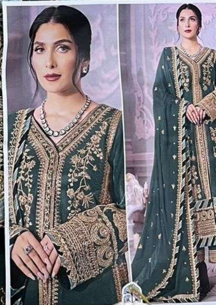
AAEESHA Vol-2 Colour Faux Georgette with Embroidery (Cut-2.5 Mr.) TOP 801 D.No. 10 DUPATTA