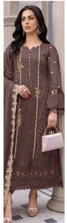
D.NO.158 - D