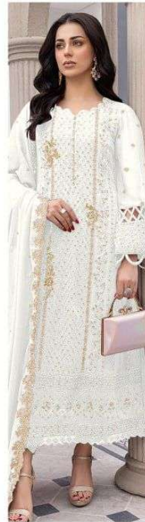
D.NO.158 - C