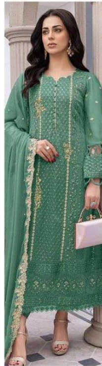
D.NO.158 - B