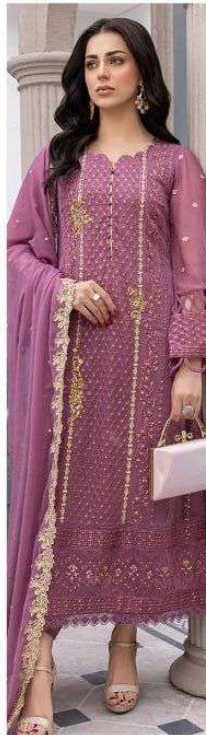
D.NO.158 - A