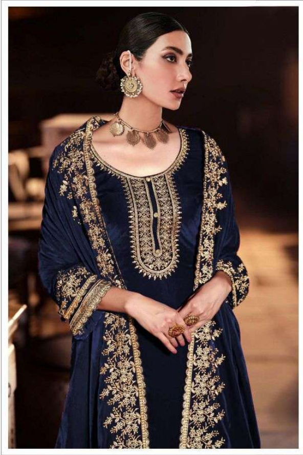
D.NO.160 - D

TOP :- VELVET DUPATTA :- VELVET BOTTOM :- VELVET WORK :- JARI SEQUENCE