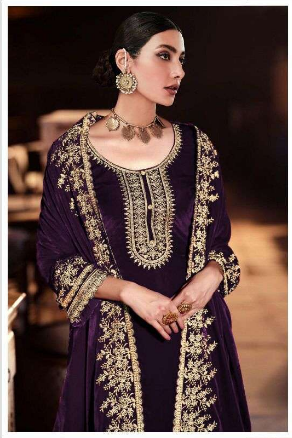
D.NO.160 - C

TOP :- VELVET DUPATTA :- VELVET BOTTOM :- VELVET WORK :- JARI SEQUENCE