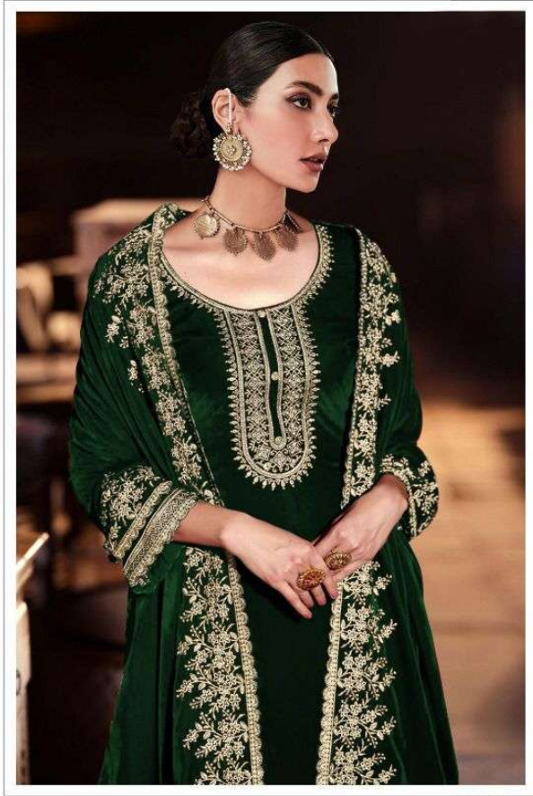
D.NO.160 - B

TOP :- VELVET DUPATTA :- VELVET BOTTOM :- VELVET WORK :- JARI SEQUENCE