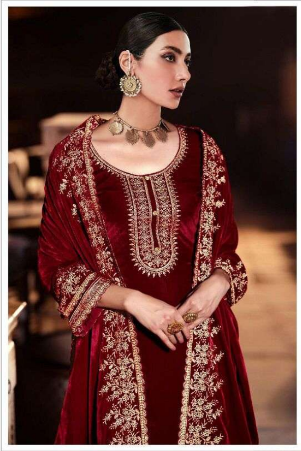
D.NO.160 - A

TOP :- VELVET DUPATTA :- VELVET BOTTOM :- VELVET WORK :- JARI SEQUENCE