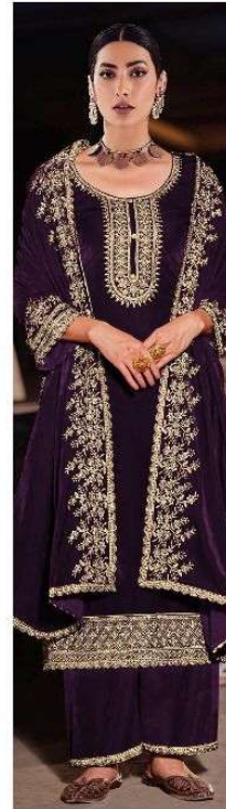
D.NO.160 - C