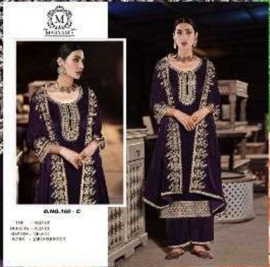
0190-100 - C 100% velvet Embroidered Sleeves, Neckline and Hem