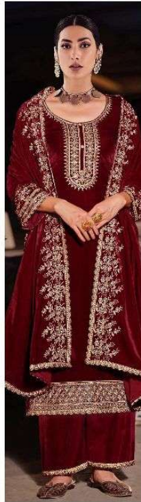
D.NO.160 - A