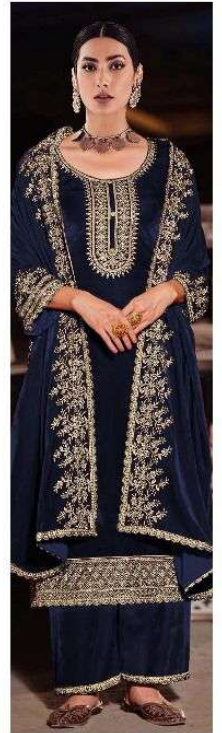
D.NO.160 - D