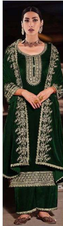
D.NO.160 - B