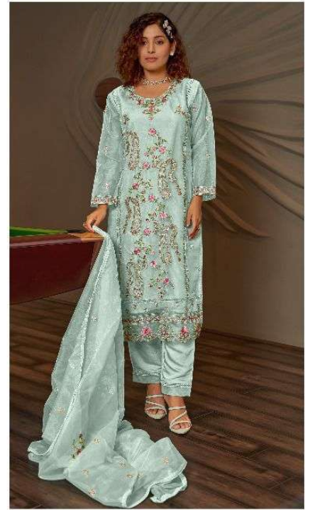
C - 1601 C