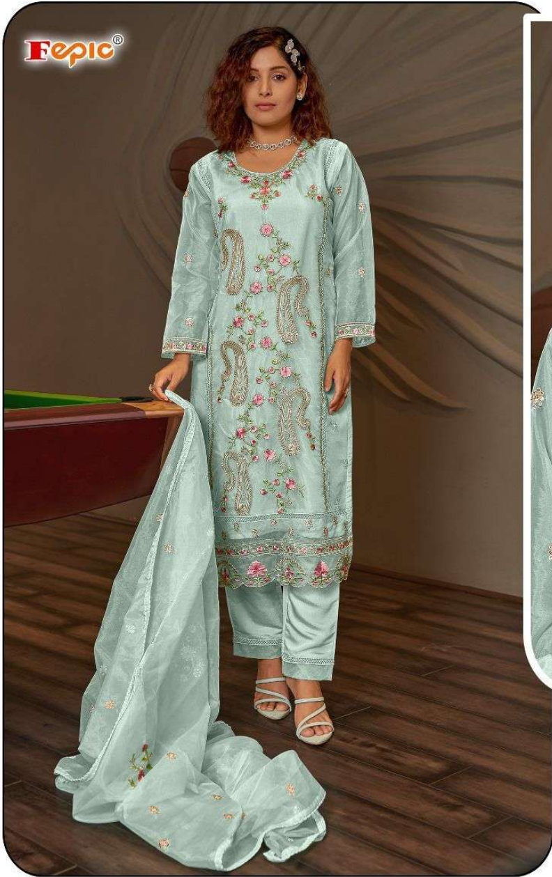
C - 1601 C