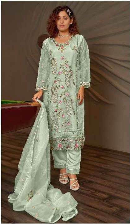
C - 1601