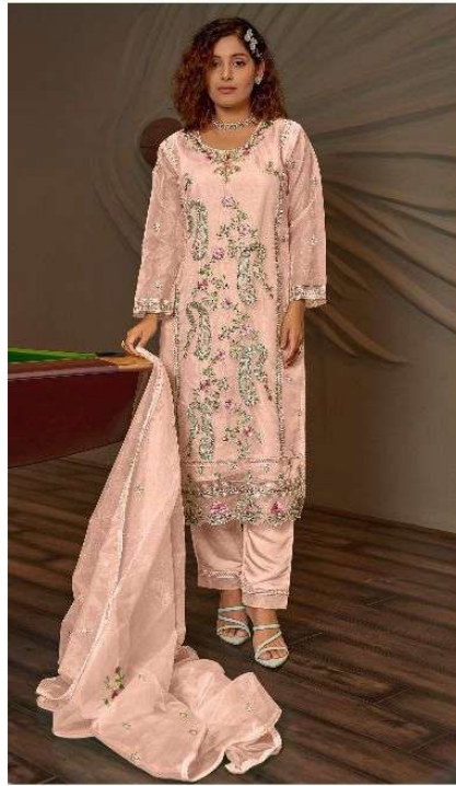
C - 1601 B