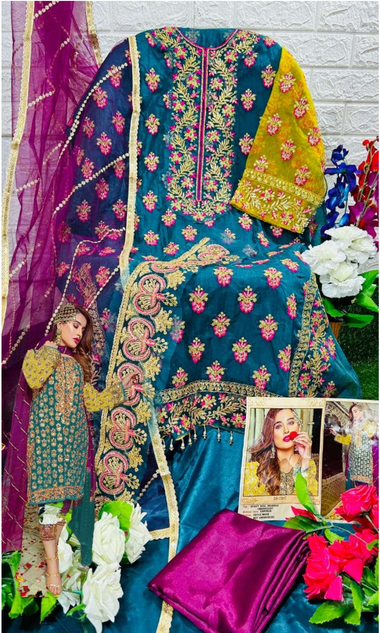
15-170 C TOP: HEAVY DOLL, BANGALOR EMBROIDERY: KARTHIK BOTTOM: JAS, KARTHIK JEWELRY: PETER WOOD HAIR: KUNJIBERRY