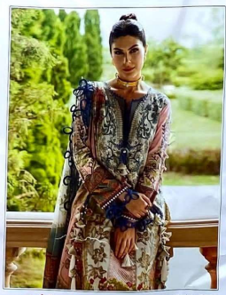
Bliss VOL. 02 LAWN DUPATTA D.No-2001