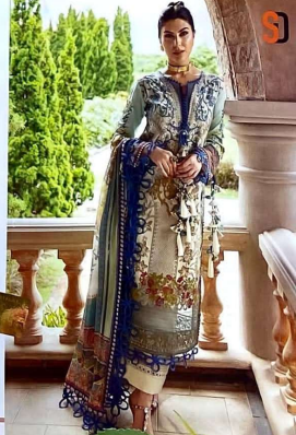
Bliss VOL. 02 D No- 2005 LAWN DUPATTA