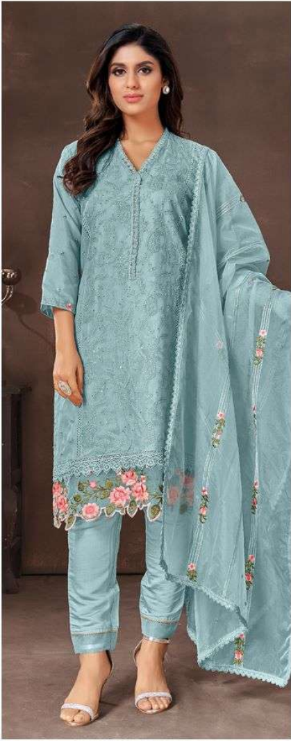
C - 1620 A