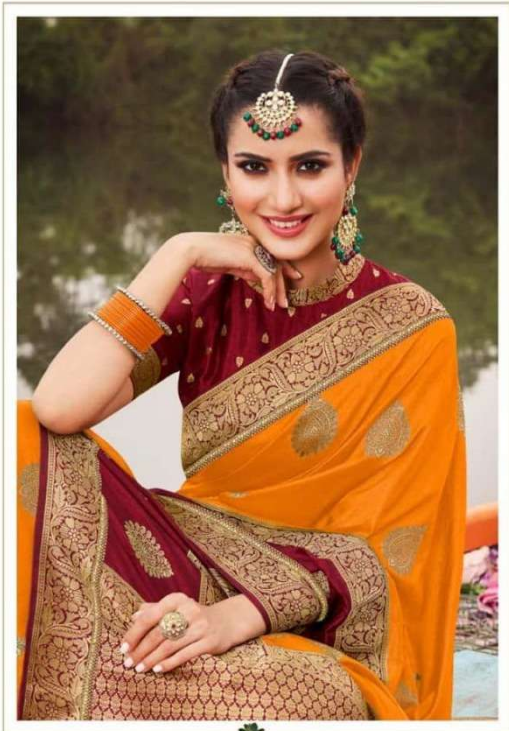
The glamour is something which will fulfill all the requirements for glossy & trendy look.