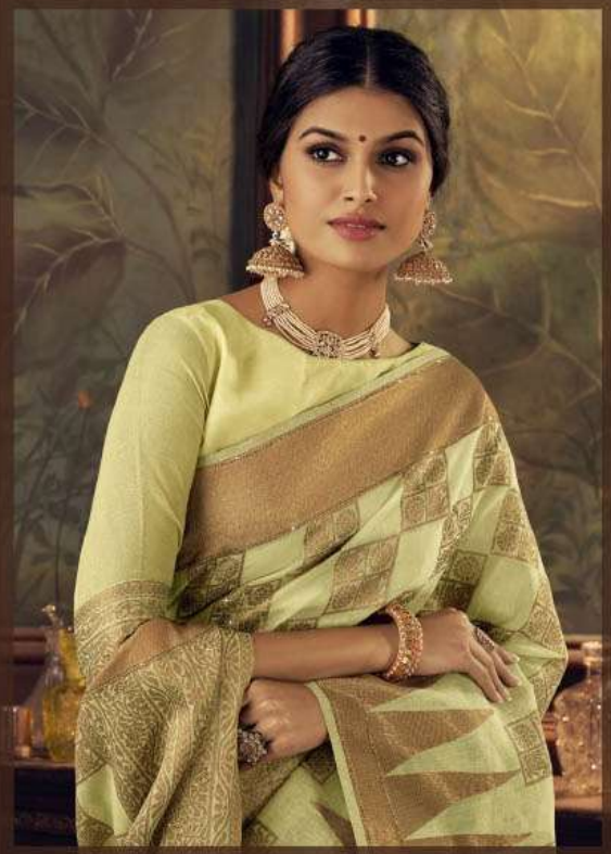
Fun with fabric for the feminine in you.