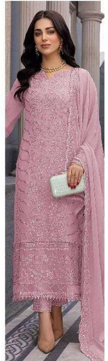
D.NO.161 - D