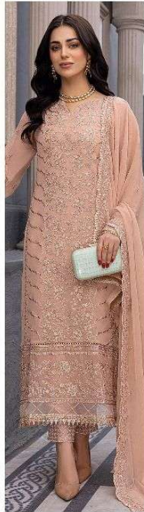
D.NO.161 - A