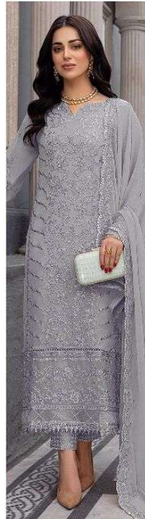
D.NO.161 - B