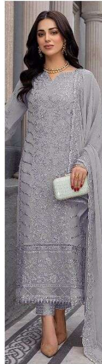
D.NO.161 - B