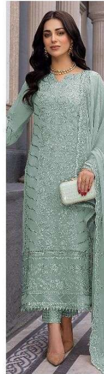
D.NO.161 - C