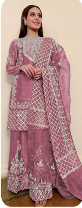
D.No | 149-C