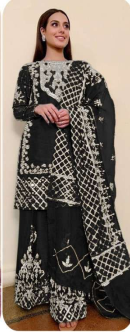
D.No | 149-D