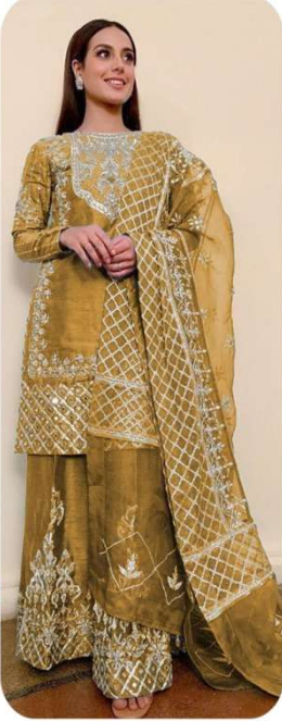
D.No | 149-B