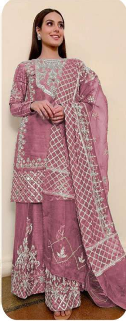
D.No | 149-C