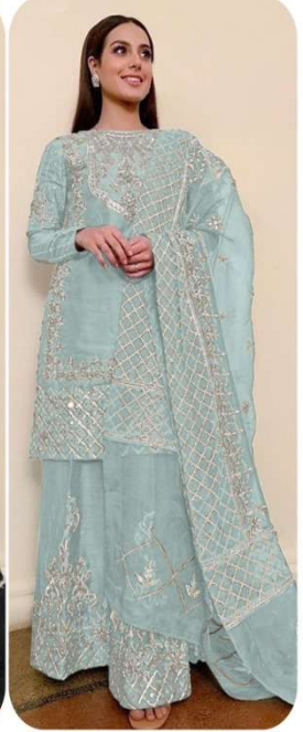
D.No | 149-E