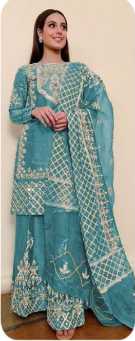
D.No | 149-A