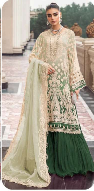
D.No | 237-C