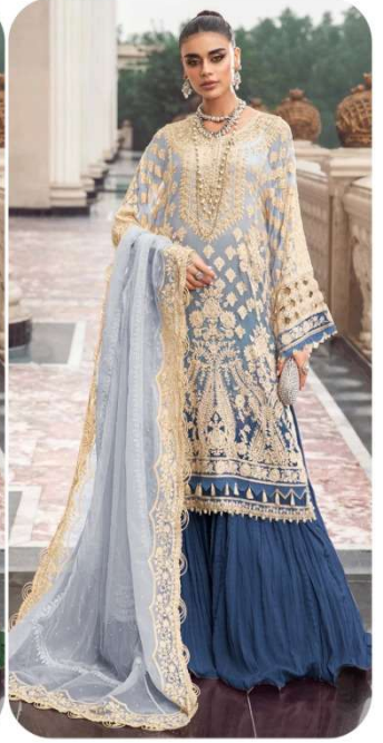
D.No | 237-D