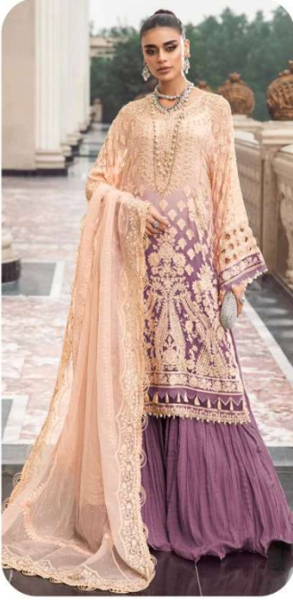
D.No | 237-A