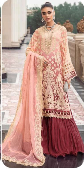
D.No | 237-B