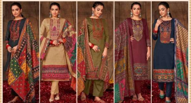
✦ D.NO.1106 ✦ ✦ D.NO.1107 ✦ ✦ D.NO.1108 ✦ ✦ D.NO.1109 ✦ ✦ D.NO.1110 ✦