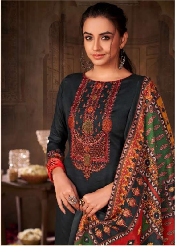
I appreciate simplicity, true beauty that lasts over time, and a little with and eclecticism that make life more fun.