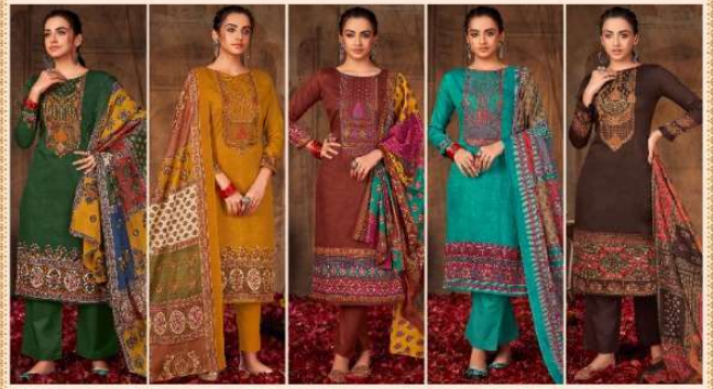
✦ D.NO.1101 ✦ ✦ D.NO.1102 ✦ ✦ D.NO.1103 ✦ ✦ D.NO.1104 ✦ ✦ D.NO.1105 ✦