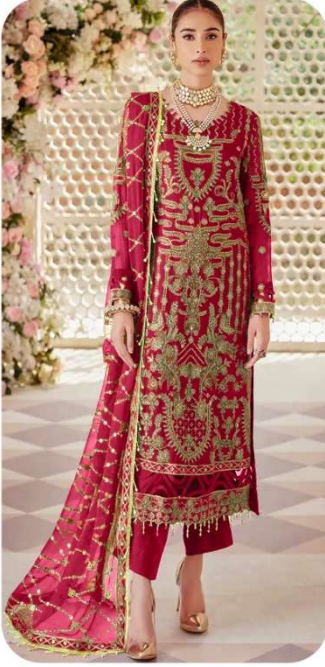
D.No | 234 A