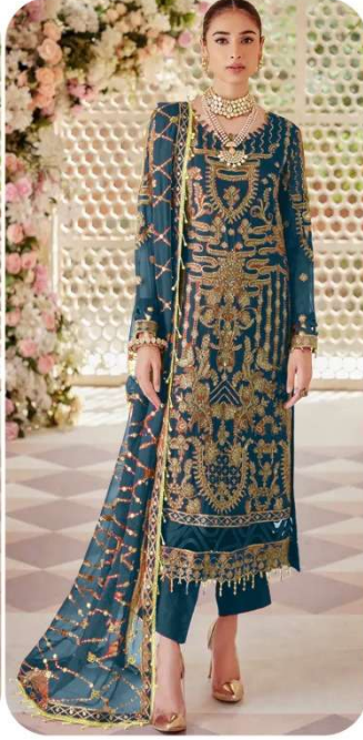
D.No | 234-B