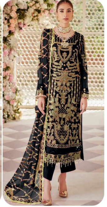
D.No | 234-D