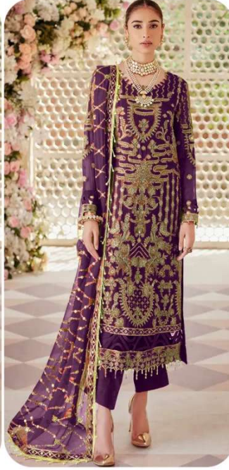
D.No | 234-C