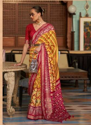
R 113 - G