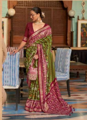
R 113 - D