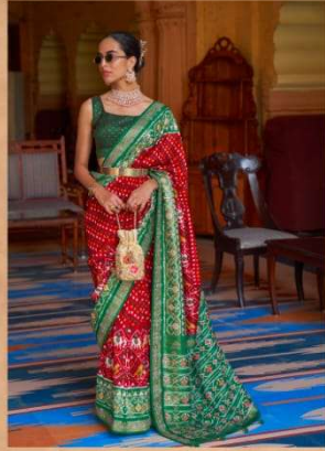
R 113 - B