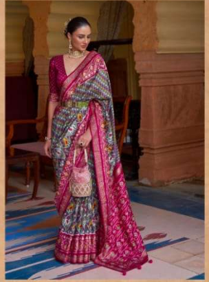
R 113 - F