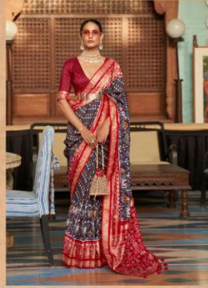
R 113 - E