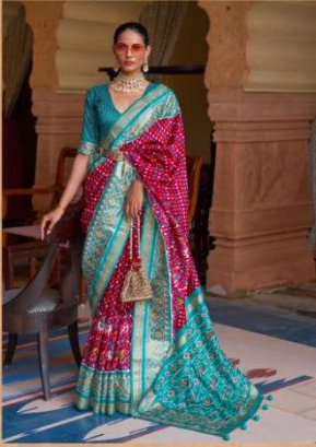
R 113 - A