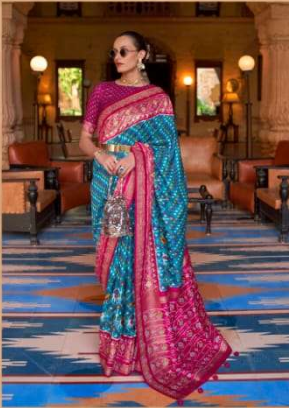
R 113 - C