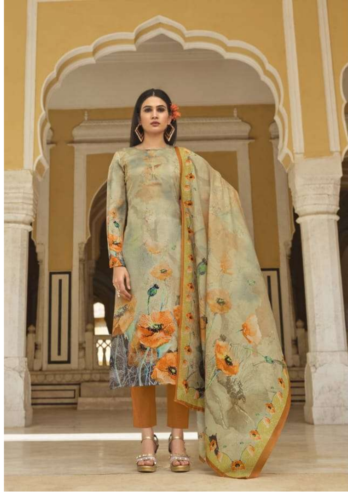
Show stealing red never goes out of style as the colour of love and mischief it remains the quintessential shade of femininity