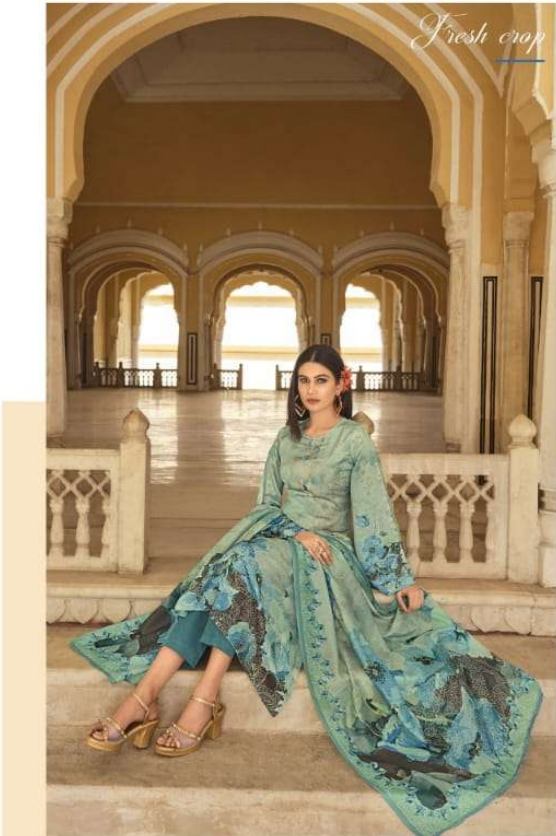
The season's newest silhouettes are all set to transform you into the goddess you wish to be.