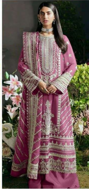
7773 D.No:-230 B