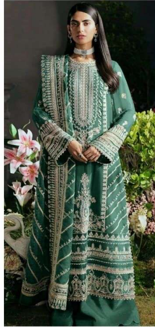
7773 D.No:-230 C