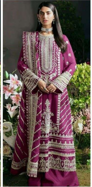
7773 D.No:-230 D