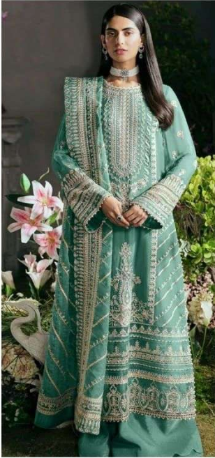
7773 D.No:-230 A

TOP- PURE GEORGETTE WITH HEAVY EMBROIDERY AND SEQUENCE WORK BOTTOM- INNER- DULL SHANTOON DUPATTA- PURE GEORGETTE FANCY DUPATTA AND HEAVY EMBROIDERY