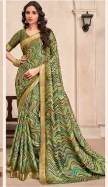
• 78212 •