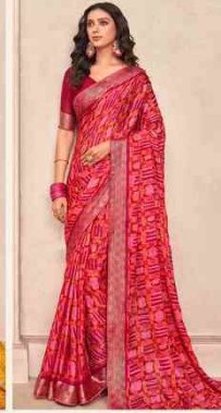
• 78205 •