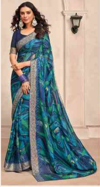
• 78201 •