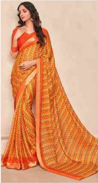
• 78207 •