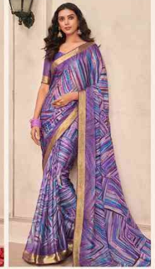
• 78206 •