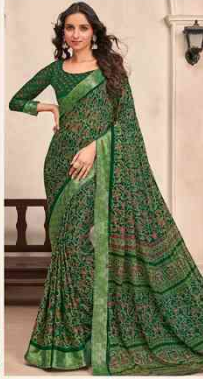
• 78203 •