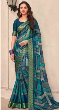
• 78208 •