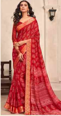
• 78202 •