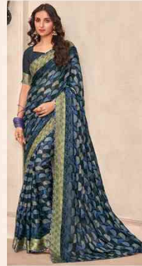
• 78210 •