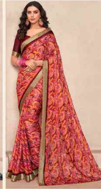
• 78211 •