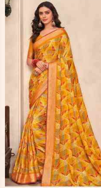
• 78204 •