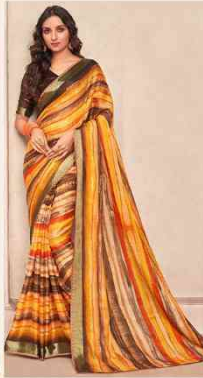
• 78209 •