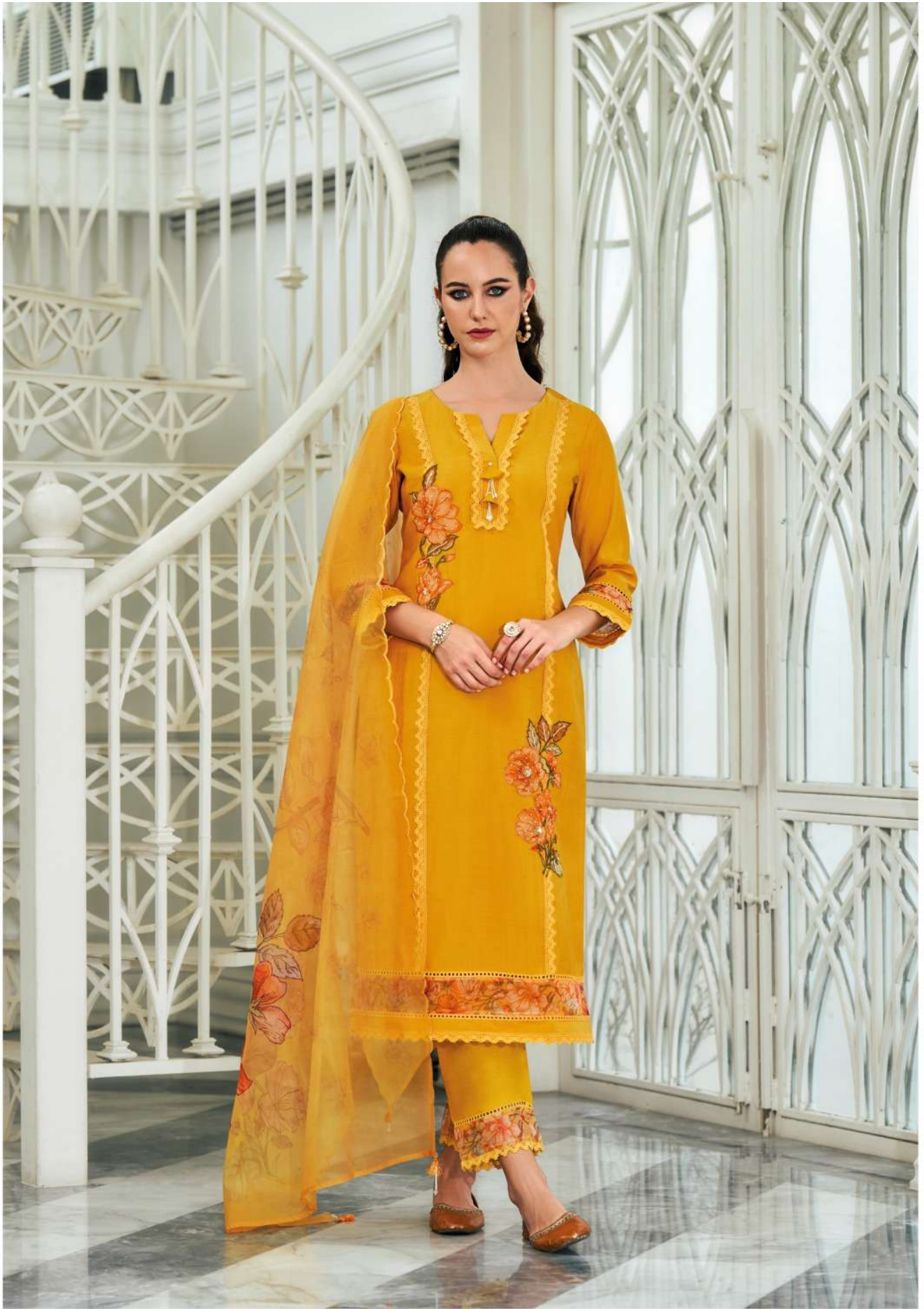
G O L D E N B E A U T Y - 1 1 5 2