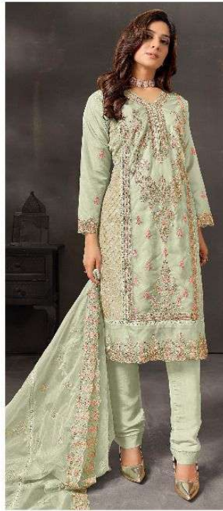
C - 1618 B