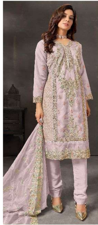
C - 1618 C