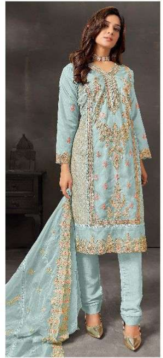
C - 1618 D