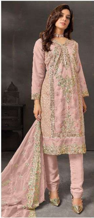
C - 1618