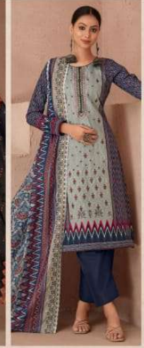
- 29006 -