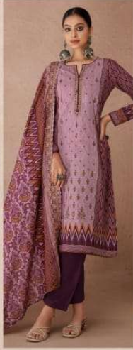
- 29002 -