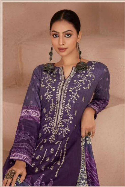
29001 Ultimate collection A dress is a wearable canvas, expressing artistry through fabric, design, and cultural nuances, symbolizing individuality and creativity.