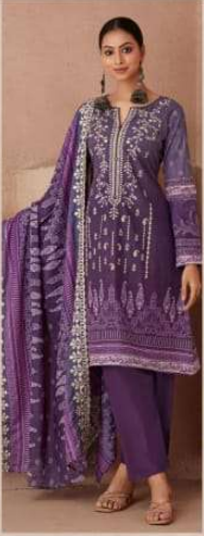
- 29001 -