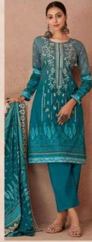
- 29004 -