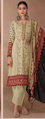
- 29005 -