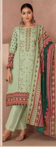
- 29003 -