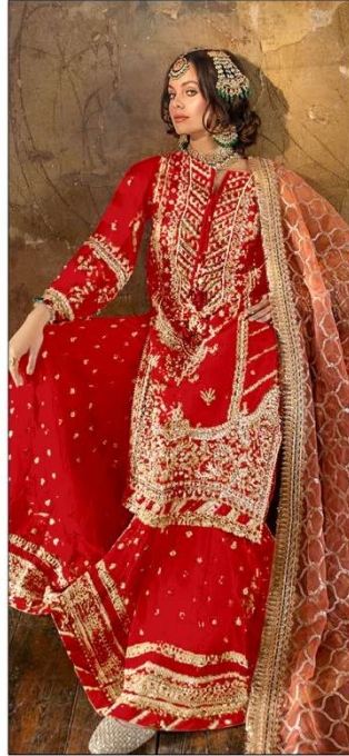
S - 123 M