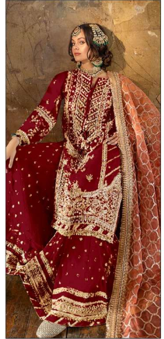
S - 123 O