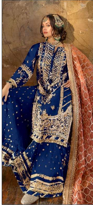
S - 123 N