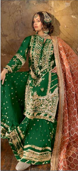
S - 123 L

Top : Organza heavy embroidered with daimond work Inner T/B : Heavy santoon Bottom : Organza heavy embroidered with daimond Dupatta : Organza heavy embroidered with four side lace