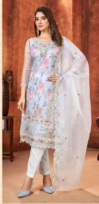
S - 240 B