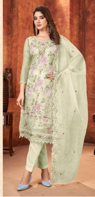
S - 240 C