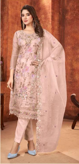
S - 240 A

TOP ORGANZA HEAVY EMBROIDERY WORK WITH HANDWORK BOTTOM DULL SHANTUN INNER FRINCH CREP PRINT DUPATTA ORGANZA HEAVY EMBROIDERY WORK