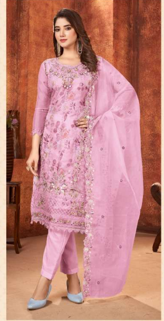
S - 240 D