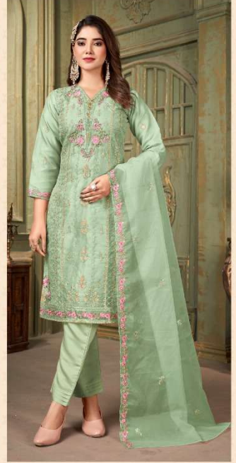
S - 247 D