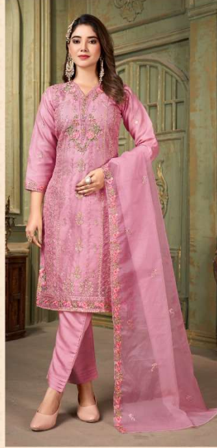
S - 247 C