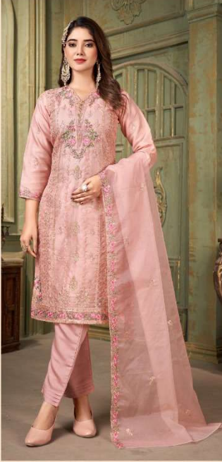
S - 247 A