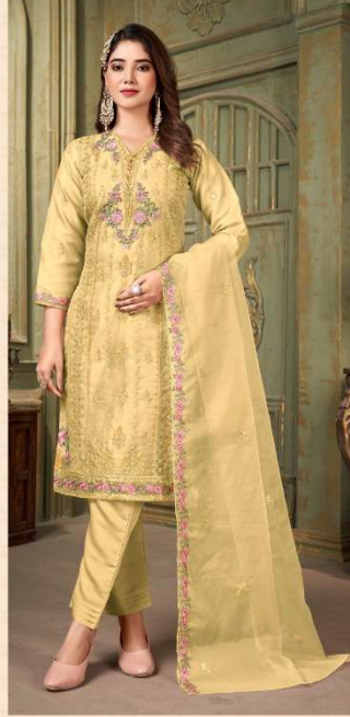
S - 247 B