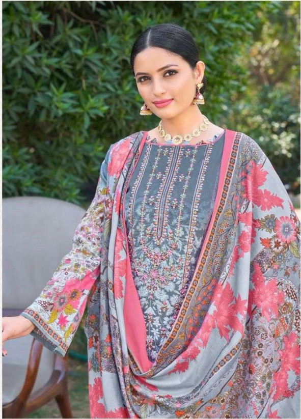
Immortalising style, redefining fashion