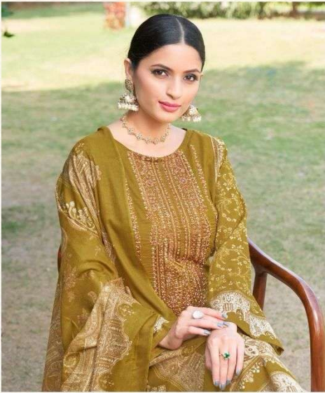
Immortalising style, redefining fashion.