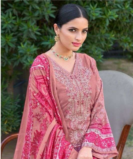
Exploring a Spectrum of brilliant colours with contemporary flair