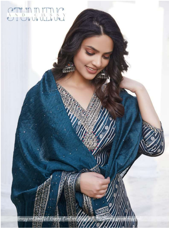
Breezy and Beautiful Keeping it cool and classy with this breezy kurta and shawl