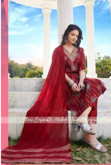
Ethnic Ensemble. Modern Touch. Alluring contemporary twist to timeless dress classes!