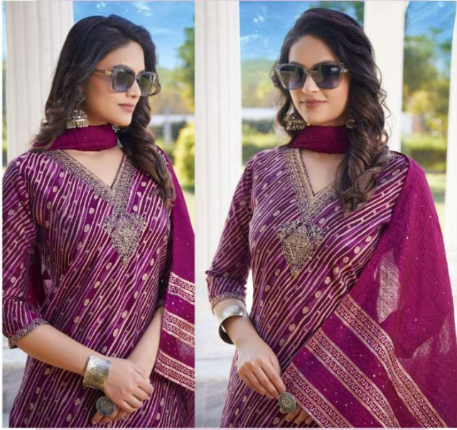
Twirling into Tradition Spinning through the day with this gorgeous dress trend