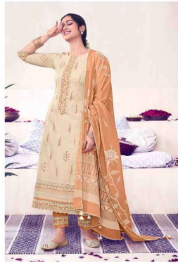
LOOK | 8985