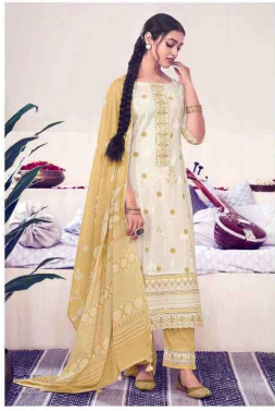
LOOK | 8981