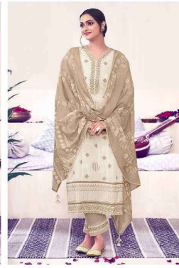
LOOK | 8986