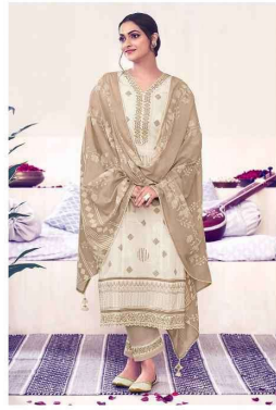
LOOK | 8986