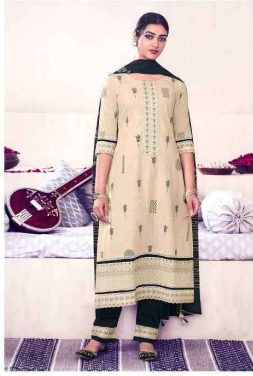
LOOK | 8983