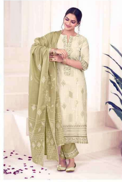
LOOK | 8984