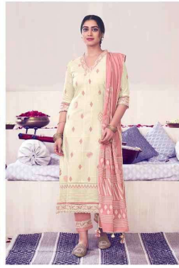
LOOK | 8982