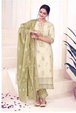
LOOK | 8984