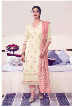
LOOK | 8982