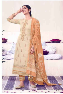
LOOK | 8985