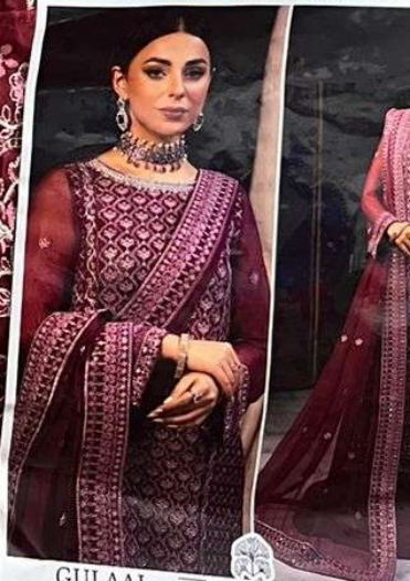
GULAAL Vol-4 TOP Faux Georgette with Embroidery (Cut-2.5 Mtr.) ZAHA D.No BOTTOM-INNER Dull Santoon (Cut-4.20 Mtr.) DUPA