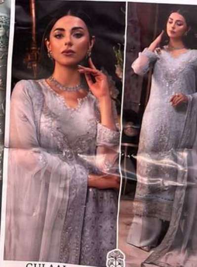
GULAAL Vol-4 TOP Faux Georgette with Embroidery (Cut-2.5 Mir) ZAHA BOTTOM-INNER Dull Satin (Cut-4-20 Mir) D.No. 10 GUPATH