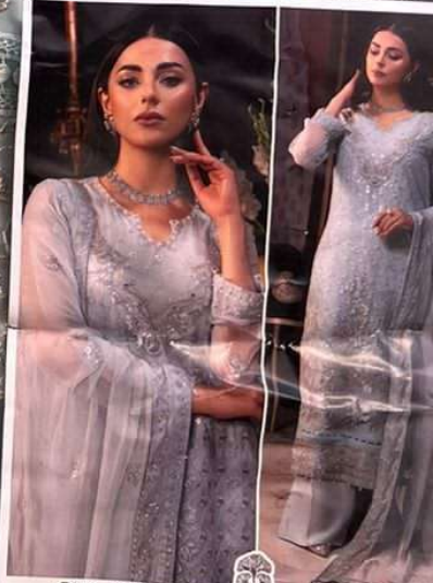
GULAAL Vol-4 TOP Faux Georgette with Embroidery (Cut-2.5 Mir) ZAHA BOTTOM-INNER Dull Satin (Cut-4-20 Mir) D.No. 10 GUPATH