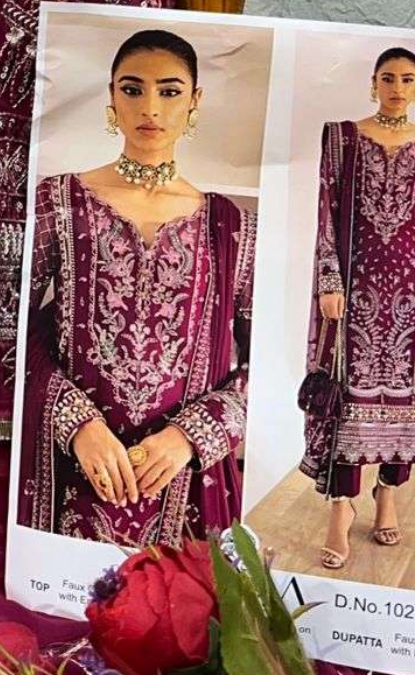
TOP Faux with D.No. 102 DUPATTA Faux with