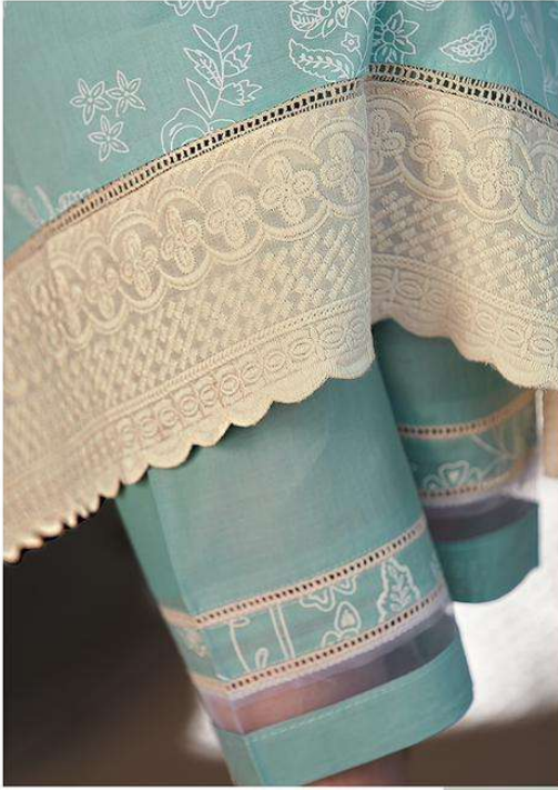
→ SUNSHINE COLLECTION