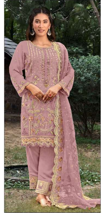
S - 289 D