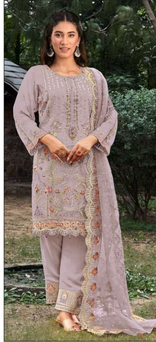
S - 289 C