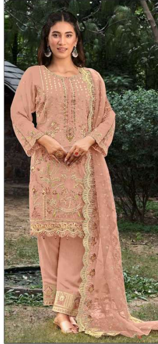
S - 289 B