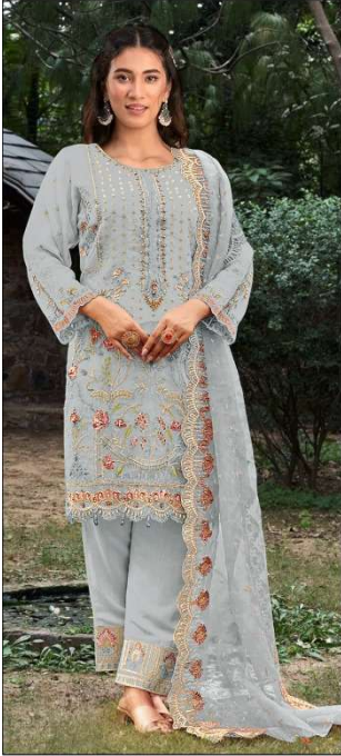
S - 289 A