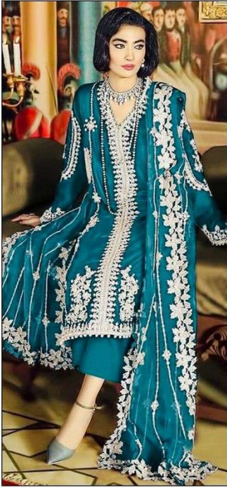
JT D.NO.139 A