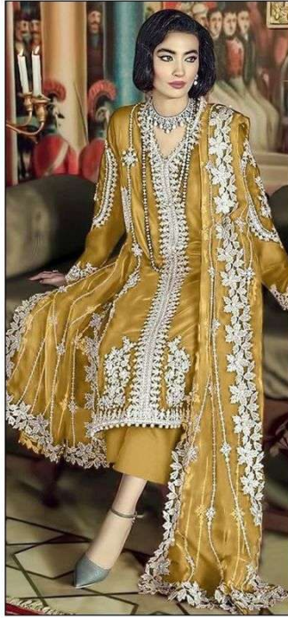
JT D.NO.139 B