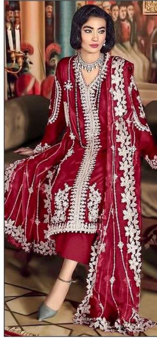
JT D.NO.139 C