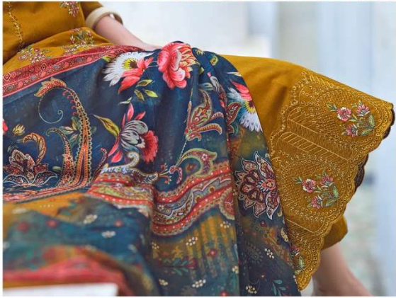
LOOKS : 909-001