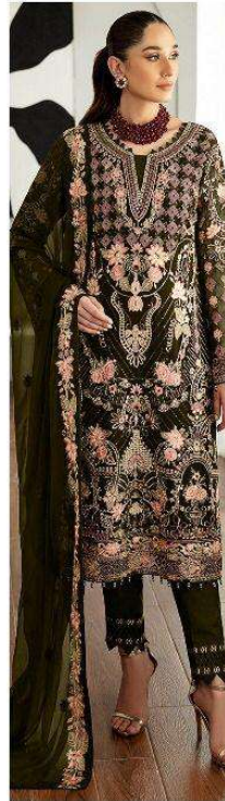
D.NO.162 - B