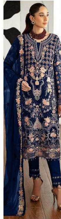
D.NO.162 - C