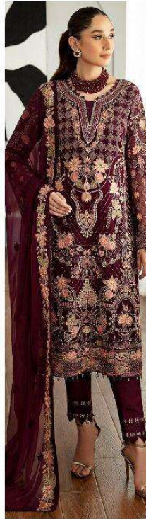
D.NO.162 - A