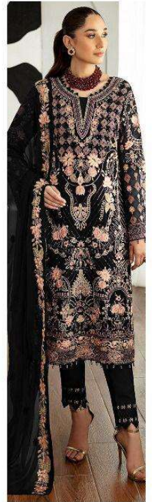
D.NO.162 - D