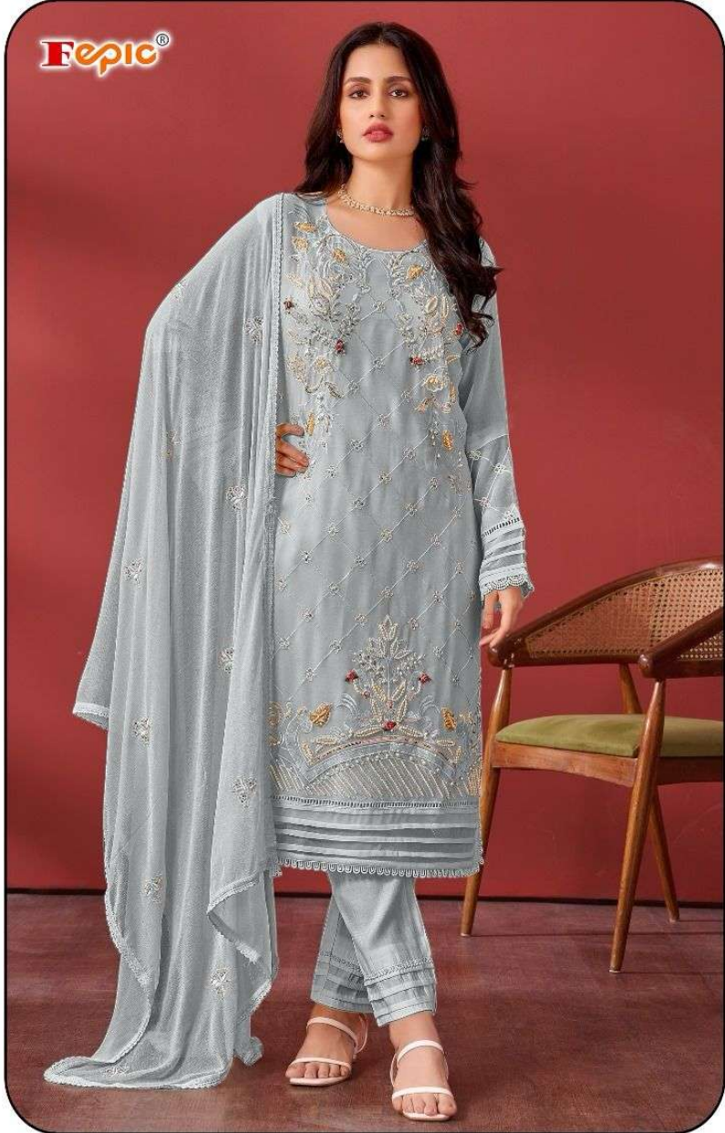
C - 1665 F

Rosemeen® Styled for your comfort by Fepic