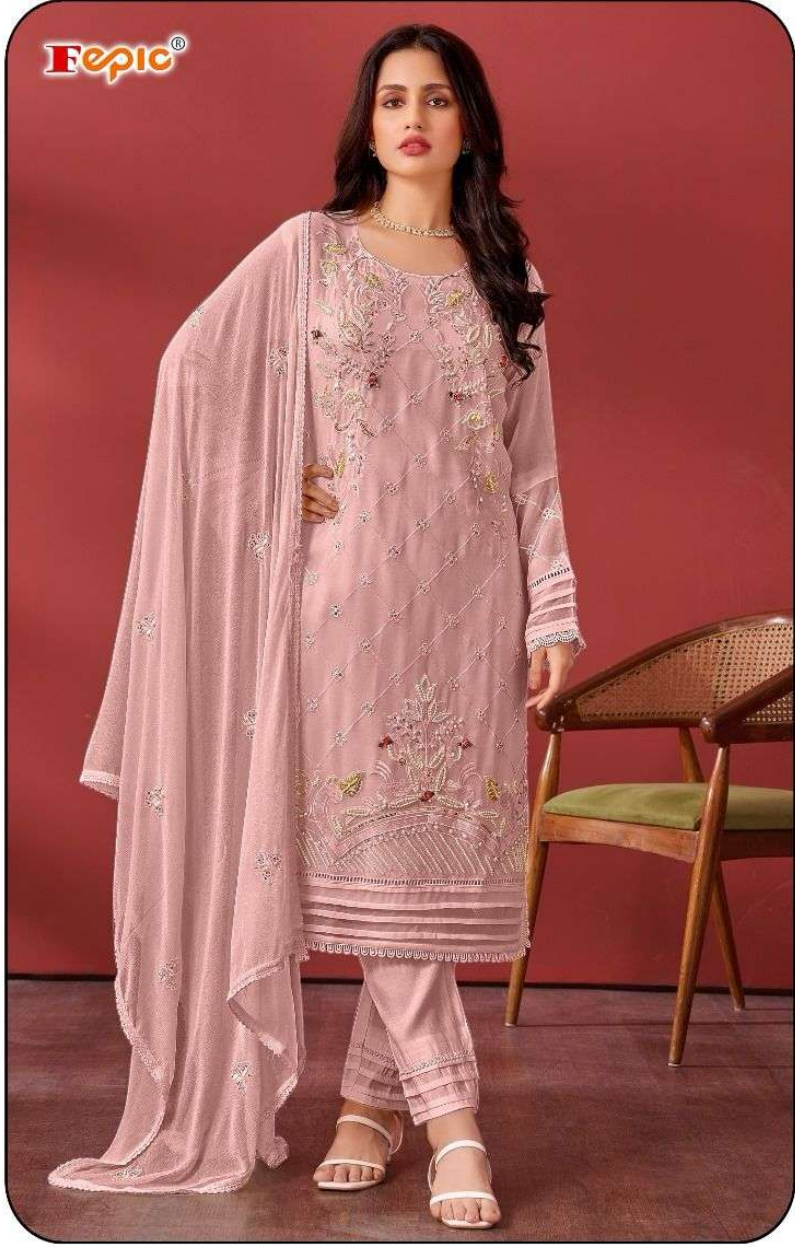
C - 1665 G

Rosemeen® Styled for your comfort by Fepic