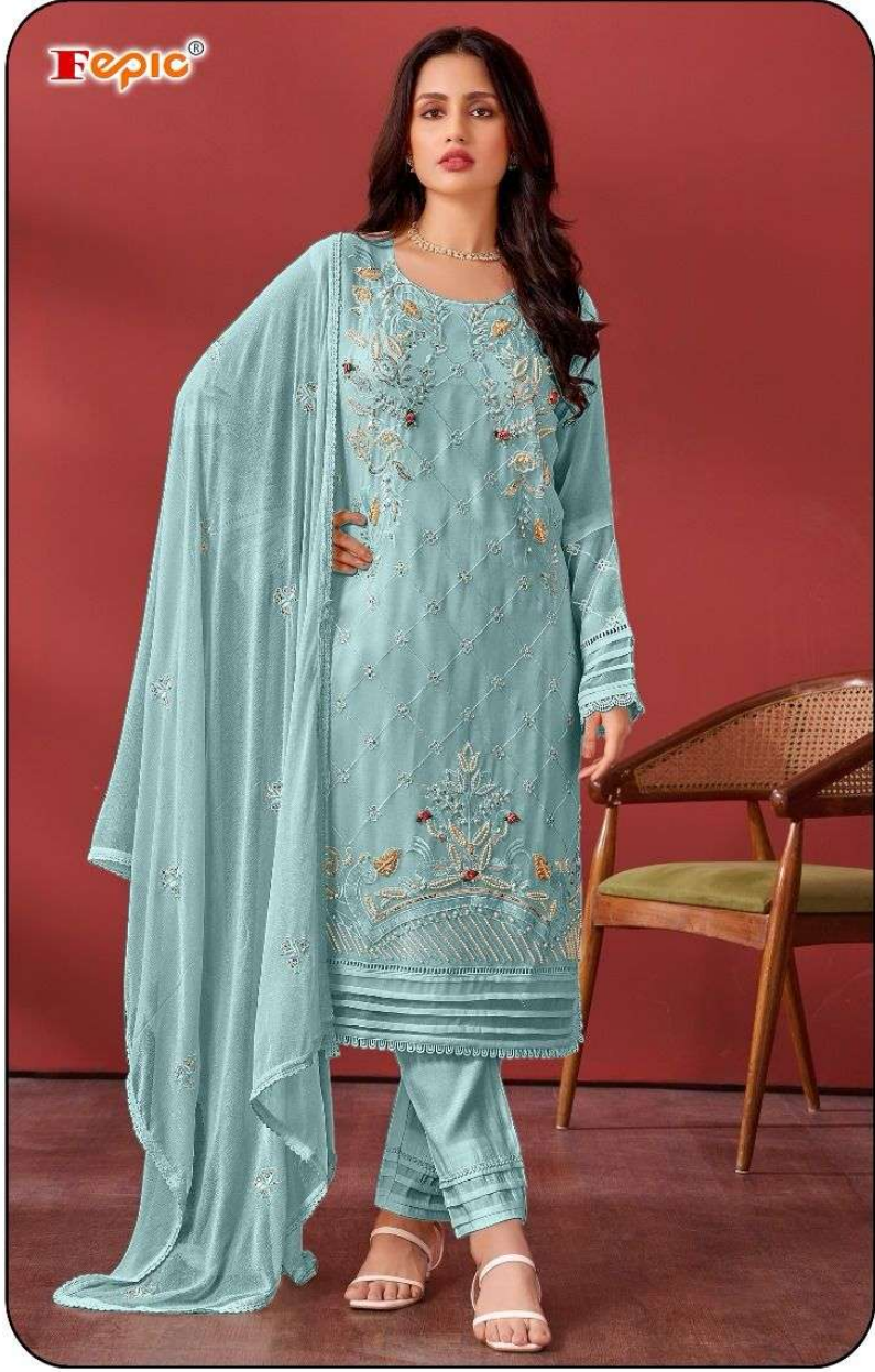
C - 1665 I

Rosemeen® Styled for your comfort by Fepic