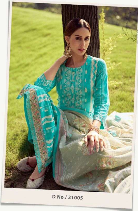
D No / 31005

Embroideries & natural fabrics make for soft & simple look to your beauty