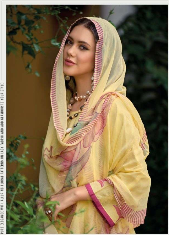
PURE ELEGANCE WITH ALLURING FLORAL PATTERNS ON LACY FABRIC AND ADD GLAMOUR TO YOUR STYLE