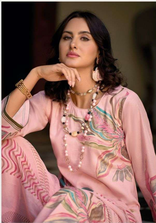
ROSHINA | 1034

PURE ELEGANCE WITH ALLURING FLOREAL PATTERNS ON LACY FABRIC AND ADD GLAMOUR TO YOUR STYLE