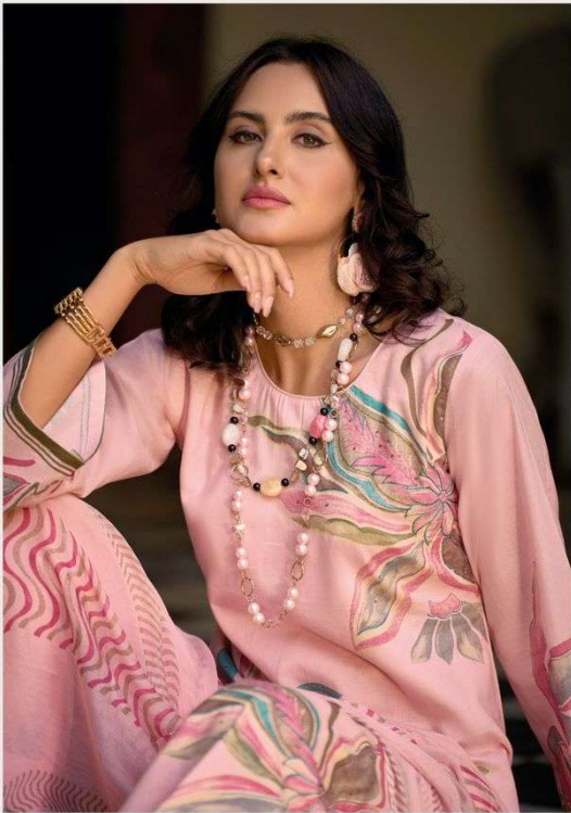
ROSHINA | 1034

PURE ELEGANCE WITH ALLURING FLOREAL PATTERNS ON LACY FABRIC AND ADD GLAMOUR TO YOUR STYLE