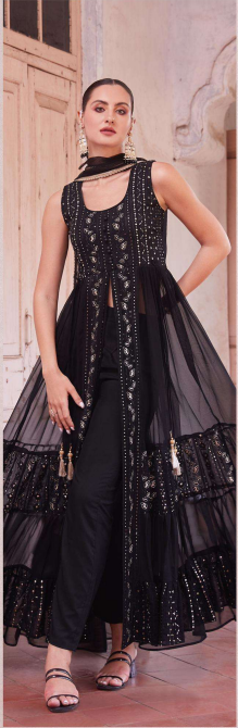
• 6001 •