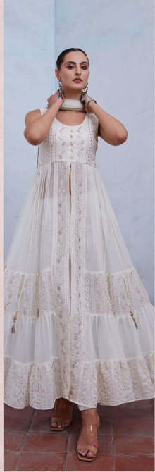
• 6002 •