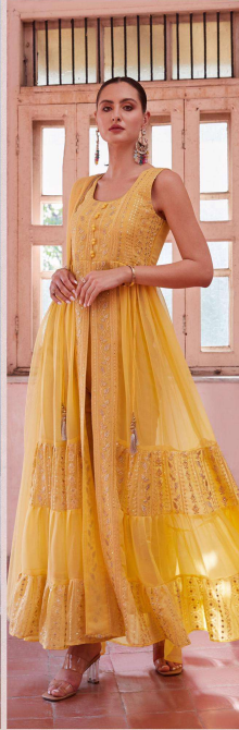
• 6003 •