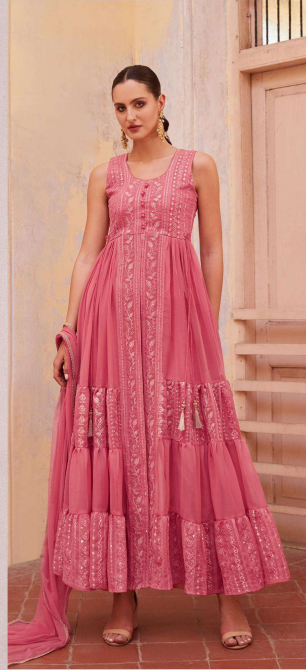
• 6004 •