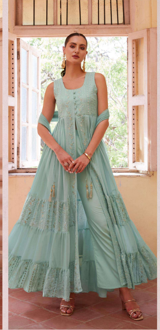
• 6005 •