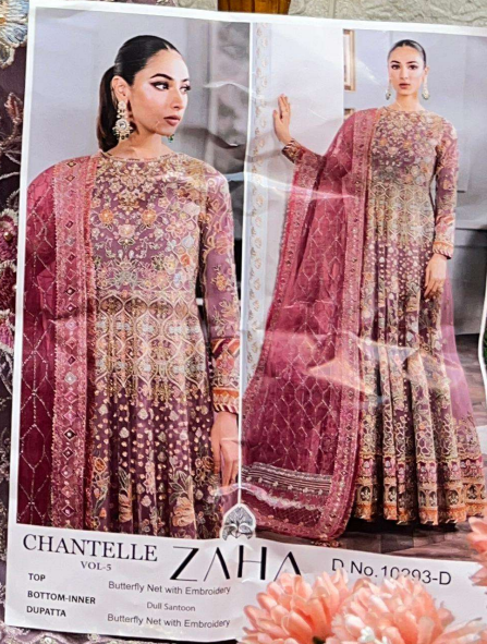
CHANTELLE VOL.5 ZAHA D No. 10293-D TOP Butterfly Net with Embroidery BOTTOM-INNER Dull Satoon DUPATTA Butterfly Net with Embroidery