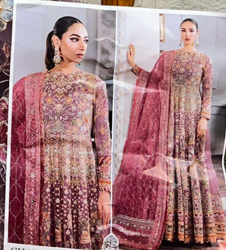
CHANTELLE VOL.5 ZAHA D No. 10293-D TOP Butterfly Net with Embroidery BOTTOM-INNER Dull Sarisoon DUPATTA Butterfly Net with Embroidery