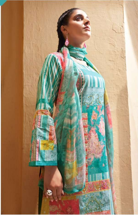
The brighter the appearance, the grander the feel. Call it a fairytale effect. 3701-