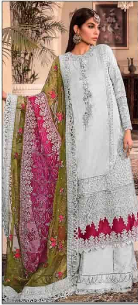
S 172 A

Top - Organza heavy embroidered with handwork Inner Bottom - Dull santoon Dupatta - Organza heavy embroidered