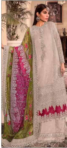
S 172 B