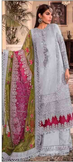
S 172 C