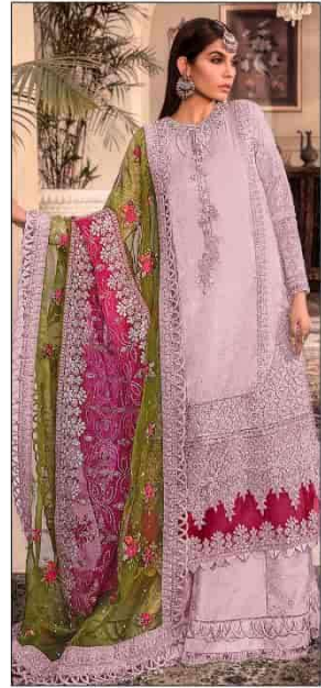
S 172 D