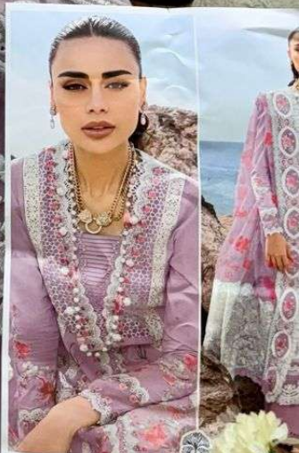
Noori Mirha ZAF TOP: Cambrie Cotton With Heavy Embroidery Work BOTTOM: INNER Semi-Lace