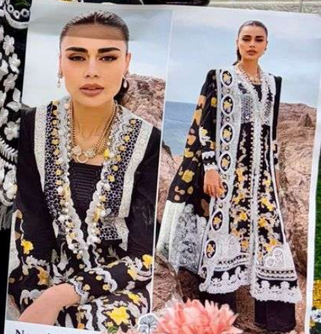
Noori Mirha TOP - Cambria Cotton Weave Heavy Embroidery