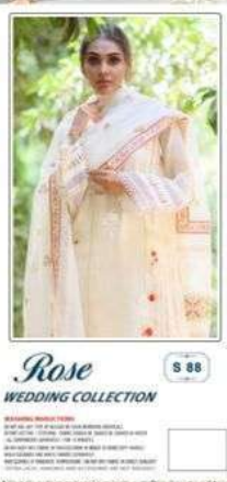
Rose WEDDING COLLECTION S 88 © 2018 SHANAYA. ALL RIGHTS RESERVED. SHANAYA IS A REGISTERED TRADEMARK OF SHANAYA. THE DESIGN AND CONSTRUCTION OF THE DRESS IS THE PROPERTY OF SHANAYA. THE DRESS IS NOT TO BE REPRODUCED OR COPIED IN ANY MANNER WITHOUT THE WRITTEN PERMISSION OF SHANAYA. THE DRESS IS NOT TO BE USED FOR ANY COMMERCIAL PURPOSES WITHOUT THE WRITTEN PERMISSION OF SHANAYA. THE DRESS IS NOT TO BE USED FOR ANY PROMOTIONAL PURPOSES WITHOUT THE WRITTEN PERMISSION OF SHANAYA. THE DRESS IS NOT TO BE USED FOR ANY OTHER PURPOSES WITHOUT THE WRITTEN PERMISSION OF SHANAYA.