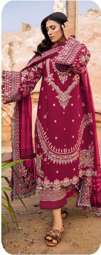
D.No | 266-A