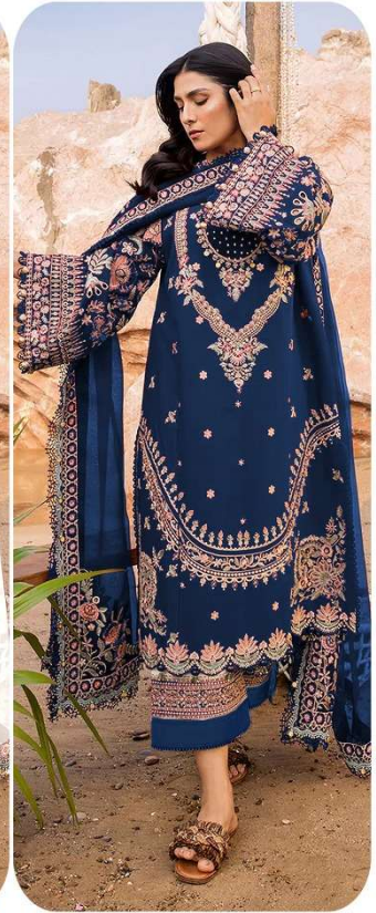
D.No | 266-D