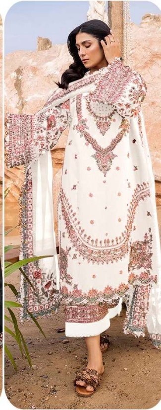
D.No | 266-C