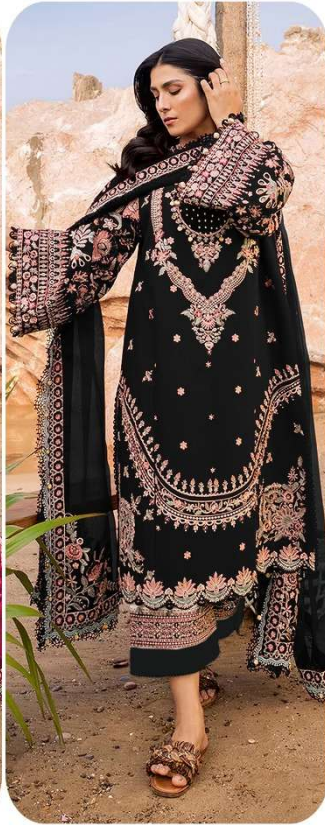
D.No | 266-B