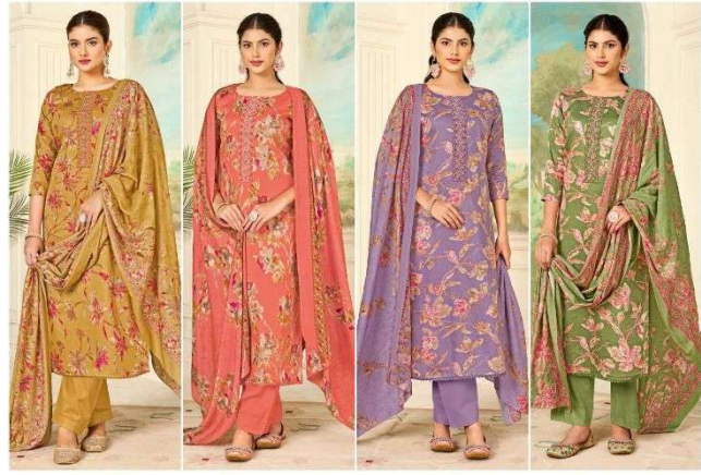
D.No. | 1001