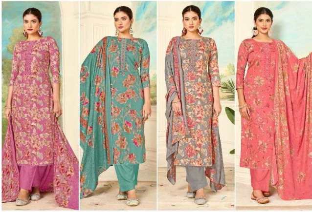
D.No. | 1005