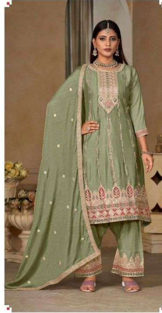
D.No.: 001 C