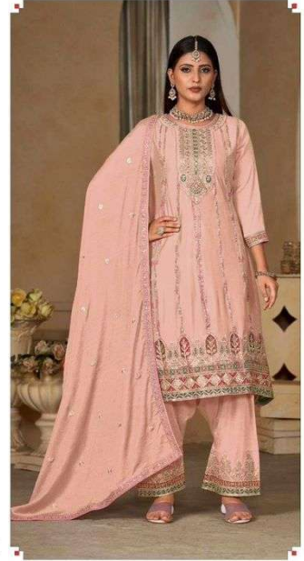
D.No.: 001 D