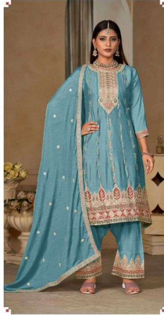
D.No.: 001 B