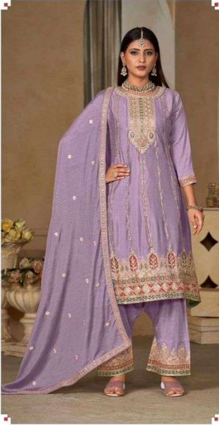
D.No.: 001 A