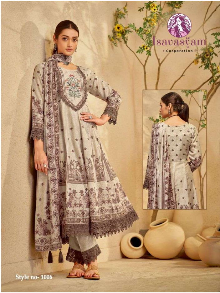
Style no- 1006