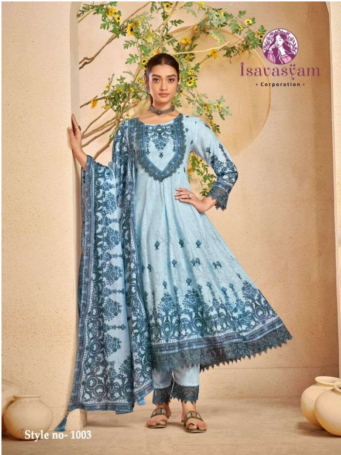
Style no- 1003