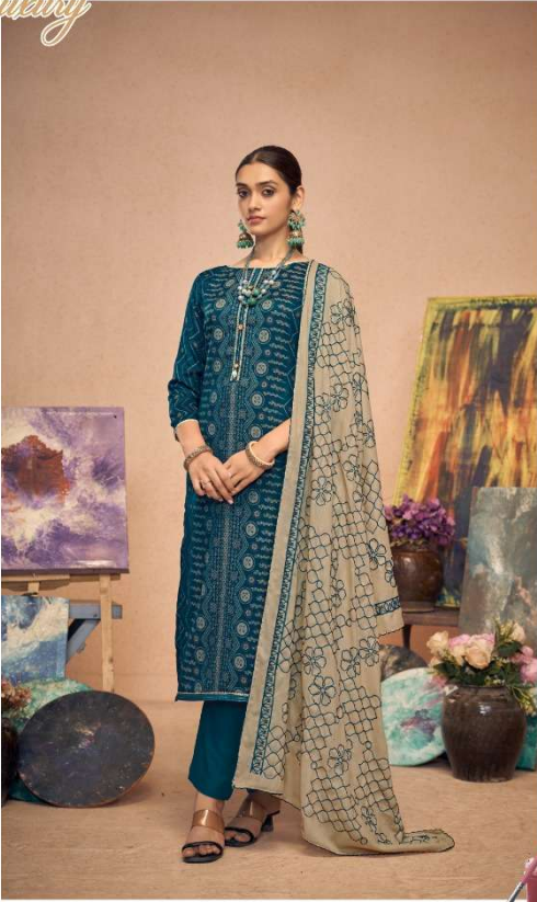
An expression of true luxury inspired by the royals. D.N.94003