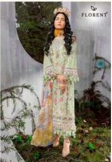
D.No. 1009-B TOP - PURE COTTON WITH HEAVY BEZEL EMBROIDERY BOTTOM - NEW LAM AN DETAILS - COTTON BEZEL WITH DIGITAL PRINT