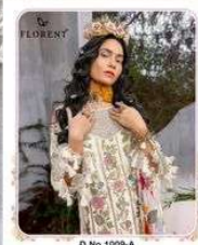
D. No. 1000-A 100% PINK COTTON WITH DELICATE LACE EMBROIDERY 100% LACE - 100% IN A 100% LACE - 100% IN A