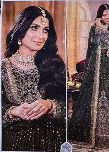
CHANTELLE ZAHA D.No.1 Vol-10 TOP Butterfly net with Embroidery BOYSOM INNER Dull Sarson GUPATTA Butterfly net with Embroidery

CARE INSTRUCTIONS 1. Do not wash 2. Do not iron 3. Do not dry clean