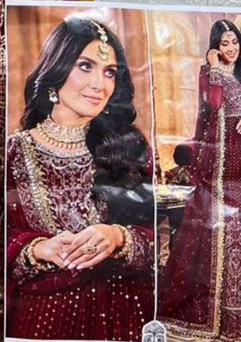
CHANTELLE ZAHA D.NC Vol-10 TOP Butterfly net with Embroidery BOTTOM INNER Dull Satoon DUPATTA Butterfly net with Embroidery