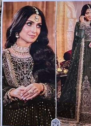
CHANTELLE ZAHA D.No.1 Vol-10 TOP Butterfly net with Embroidery BOYSOM INNER Dull Sarson GUPATTA Butterfly net with Embroidery

CARE INSTRUCTIONS 1. Do not wash 2. Do not iron 3. Do not dry clean